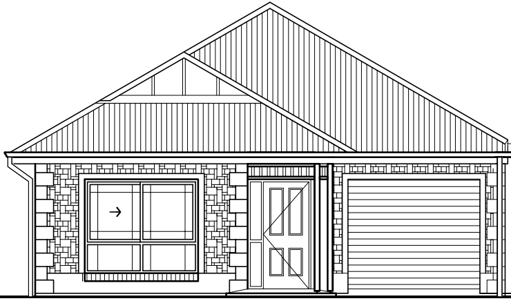
INDICATIVE FRONT ELEVATION