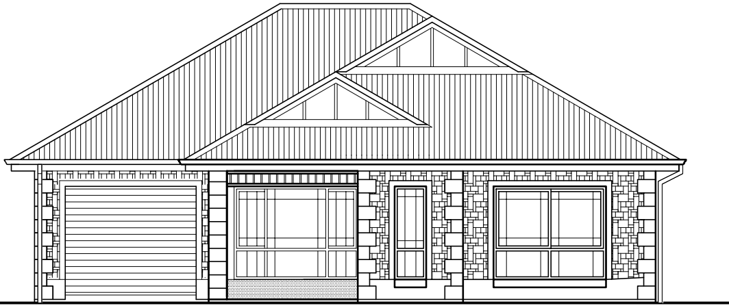
INDICATIVE FRONT ELEVATION