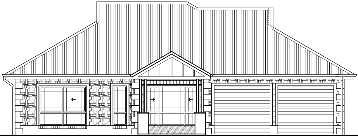
INDICATIVE FRONT ELEVATION