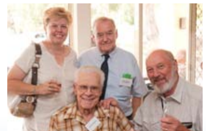
Residents and Guests

The Centre, now open to residents, offers first class facilities including a lounge with a feature fire place and large screen TV, an indoor dining area, bar area, kitchen, billiards room, fitness room, rooms for visiting health and lifestyle providers such as hairdresser and doctor.