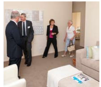
Our guests tour the villa

Despite the scorching heat, the interior was delightfully cool and the afternoon was attended by over 160 guests including Woodside Lodge residents, local business owners and many of our business partners.